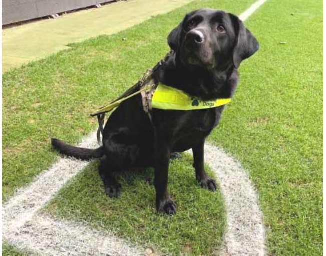
Usef on the corner spot at Kenilworth Road, ready to take a Premiership corner for the Hatters.