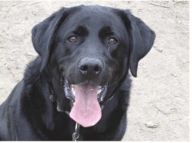
Close up of Usef's face looking very happy during a 'Take on 250' sponsored walk last year.