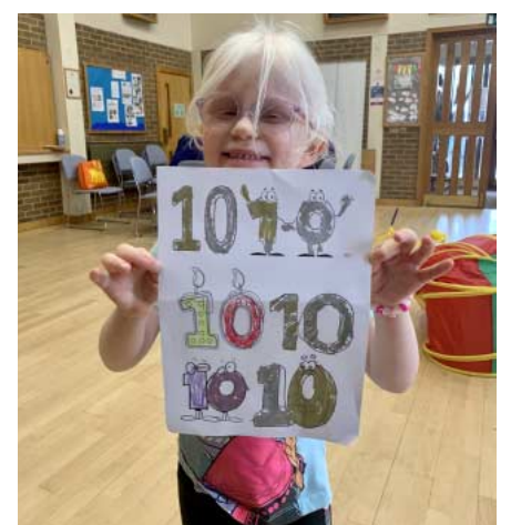
Family Group 10th Anniversary.