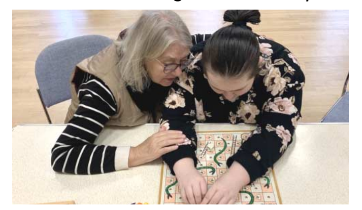
Family Group – volunteer helps with tactile Snakes & Ladders.